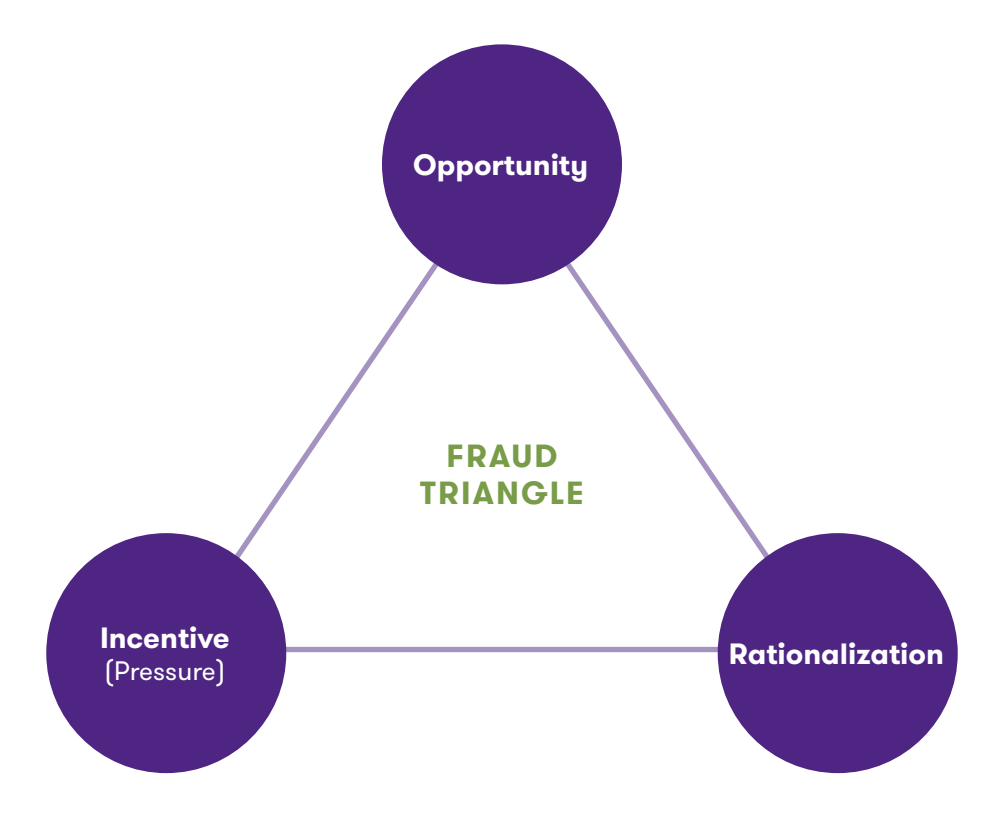
FIG. 2 FRAUD TRIANGLE

With respect to ESG reporting today, benchmarks are limited, and consistent guidance is lacking. Many audiences—even sophisticated ones—lack a full understanding of company-reported metrics. These audiences also have a limited ability to compare ESG claims across companies and sectors, which is essential to find intentional misstatements. Without the proper tools to compare ESG claims, a real opportunity to manipulate metrics exists and opens the door for fraudulent ESG-related vendors and suppliers to exploit immature programs.